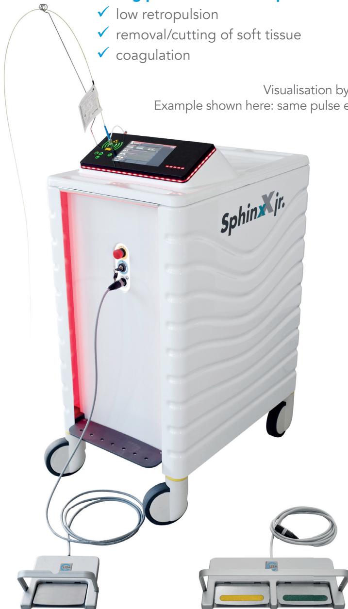
Kix footswitch Order No. 101 630 147

Visualisation by real time pulse display Example shown here: same pulse energy of 2.5 J for stone effects 100 and 10